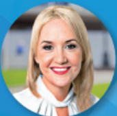
Hon Nikki Kaye

MP for Auckland Central and Opposition Spokesperson for Education and Sport and Recreation