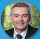
Hon Scott Simpson

MP for Auckland Central and Opposition Spokesperson for Education and Sport and Recreation